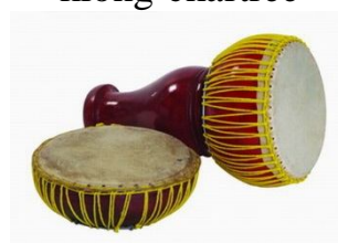
Thon – Rum-ma-na