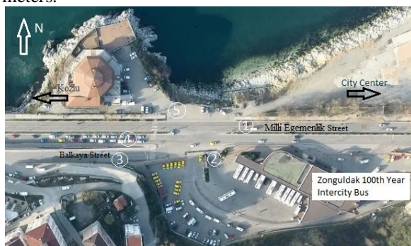
Fig.1. Zonguldak 100th Year Intercity Bus Terminal Intersection view from the air.

A view from the air of the intersection is given in Figure 1 and geometric view is given in Figure 2. As can be seen from Fig. 1 and 2, the intersection has 5 sites. All the sites were controlled by stop signs on all approaches without for the number 5. The lane width changes between 3.30-3.40 meters without number 2. Terminal approach widths are 4.6 and 8.6 meters.