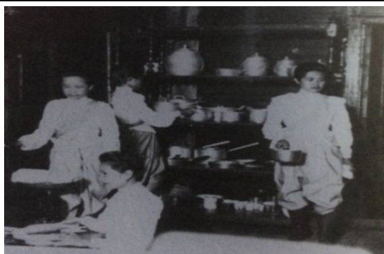
Fig. 5 Royal Cuisine Training [11]