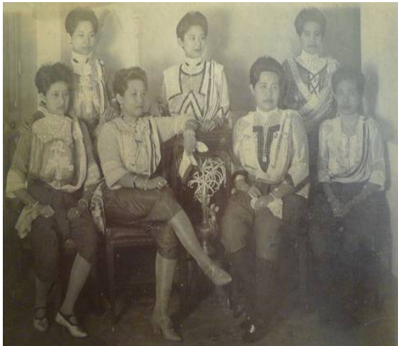
Fig. 4 The Bun-nag 's Royal consorts Source : The National Archives of Thailand [8]

The king later had to bring back his centralized power. He promoted the Royal members to play more roles in the administration, abolished the patron - client system, in which the clients were based on nobility's political and economic benefits. The adoption of the Royal consorts who were the Royal relatives and nobility family members was another strategy for strengthen the stability of the throne. It is in accordance with the social value at that time in offering daughters or nieces to serve the inner court for the progress of the ladies themselves, and certainly extended to their families. In the reign of King Rama V, he adopted 21 ladies from the Bun-nags, 1 as a queen consort, and 20 as the Royal mothers and Royal concubines. [7]