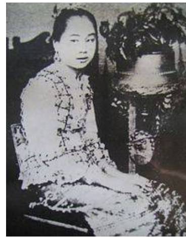
Fig. 3 Princess Dararassami Source : The National Archives of Thailand [5]

neighbor countries. In addition, this also in line with the King's centralization policy. "In 1882, Queen Victoria of England sent an ambassador from the south of Myanmar to request the Governor of Chiang Mai to adopt his daughter as hers". [4] The attempt to expand the British power in this region made King Rama V to offer diamond earrings and ring to Princess Dararassami, the daughter of Chiang Mai's governor who later was elevated as the Royal Queen Consort, as engaged collateral at the age of twelve. This showed the strategy of King Rama V's strategy in strengthening the relationship with the north before the achievement of the British Empire. However there was no evidence showing whether Thai Royal Court knew about the British idea or not. Since Chiang Mai was Thai colony, when the governor of Chiang Mai offered his daughter to King Rama V, it showed good relation between the two.