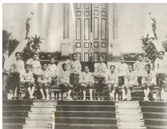
Fig. 1 The Royal consorts Source: The National Archives of Thailand [1]

or economic benefits influences. The transmission of knowledge, culture, value and thought from the Royal consort to courtiers, associates and later generations was concentrated since it was one way to prolong those precious practices continue up to present.